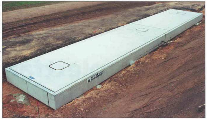
Installation of plant-assembled scale