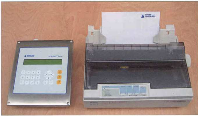
Weighing indicator Disomat and printer