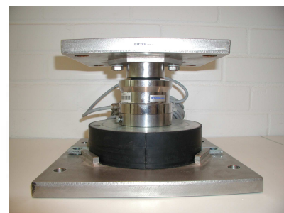
Stainless steel DMS load cells, compact construction, special elastomer bearings