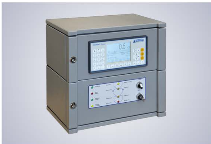
Scale control Disomat Tersus