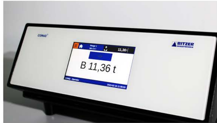
Weighing electronic Coniq Control